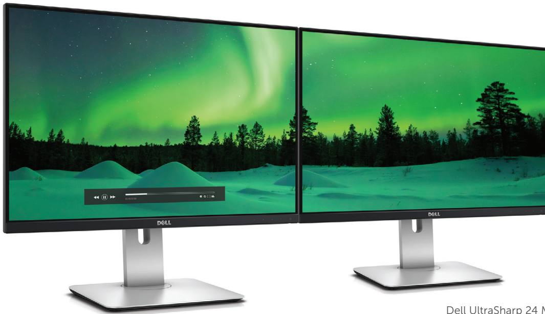
Dell UltraSharp 24 Monitor | U2415 61.1 cm (24 inches)