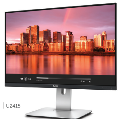
Dell UltraSharp 24 Monitor | U2415 61.1 cm (24 inches)

For More Information visit www.dell.com/monitors