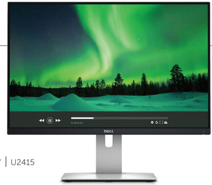
Dell UltraSharp 24 Monitor | U2415 61.1 cm (24 inches)